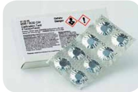
BOD CM test tablets, order code: 41 83 28

The tablets are easy to use. Simply place a tablet in the BOD bottle, start the measurement process, read off the BOD value after 5 days, and then compare with the defined value. If this value is within the quoted tolerance, this means that the BOD measuring system is functioning correctly.