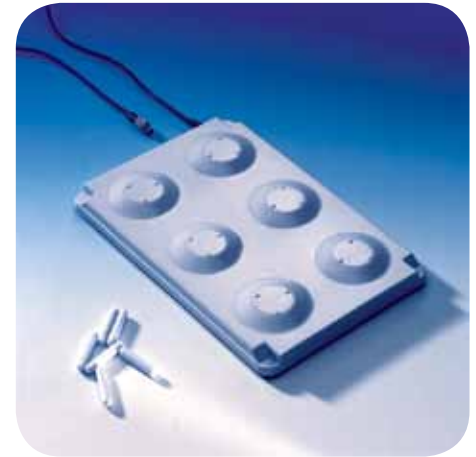
Inductive stirring system

The microprocessor-controlled Lovibond® inductive stirring system is non-wearing and maintenance-free. In other words, there are no moving parts in the system.