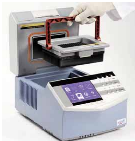
Thermal cycler door open with a heater system on the back side of the door to avoid condensations.

Each block incorporates a connector that identifies it and allows the thermocycler to recognize it. There's also an extractor handle which makes easy the block support use.