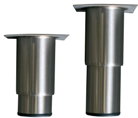
Easy to mount stainless steel adjustable feet come also with every cabinet