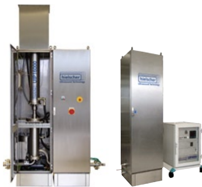
ultrasonic dispersing systems