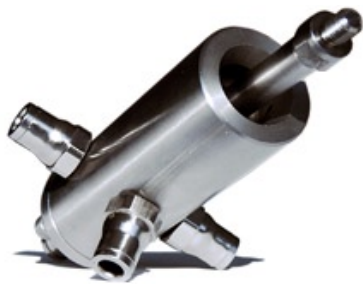
stainless steel flow cell D7K with MS7D