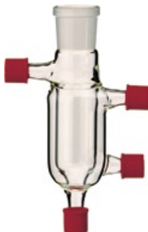
glass flow cell for UP100H

For our ultrasonic processors we offer flow cells made of glass or stainless steel. The liquid to be sonicated is led in from below and passes through the cavitation zone under the sonotrode. The appropriate sonotrodes are equipped with O-rings, that are fitted closely to the cell wall or the PTFE-adaptor. For higher pressures and temperatures the sonotrodes may be equipped with metallic oscillating-free flanges that are mounted to the stainless steel flow cells. The selected flow rate corresponds to the energy input required. The temperature of the medium can be influenced by means of a cooling jacket. Special designs of the flow cell, e.g. several supply connectors when emulsifying, are manufactured according to the demands of the customer. A new product in our product range is the mini flow cell (patent pending). When using this mini cell, the medium is hermetically sealed, so that the sonication can be realized without contamination.