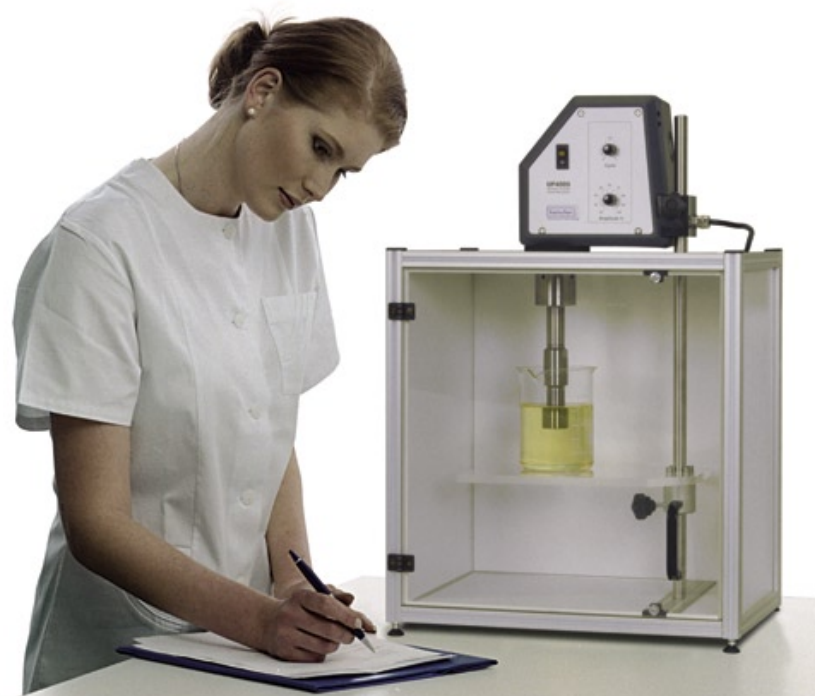
UP400S with H22 in sound protection box

The ultrasonic processor UP400S (400 watts, 24kHz) is our most powerful laboratory device. With sonotrodes of a diameter range from 3 to 40mm the device is suited for sample volumes from 5 to 4000ml. In flow approx. 10 to 50 liters per hour can be treated. For the preparation of test portions the UP400S is mainly used for bigger volumes. It is suited for the practical process development in the laboratory but also in the college of technology as well as for the production of small quantities. For production quantities a PC-control or a connecting lead to a central control of the user's plant is recommended in order to raise the process safety. With special flow cells and flange connections liquids can also be sonicated at high temperatures and pressures.