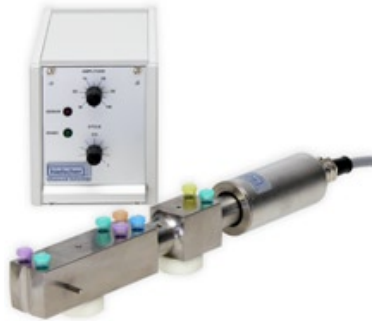
sonication of closed vials