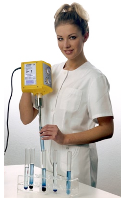
UP200H with S7

We offer a comprehensive range of accessories for the UP200H such as flow cells, stand, sound protection box, timer and PC-control.