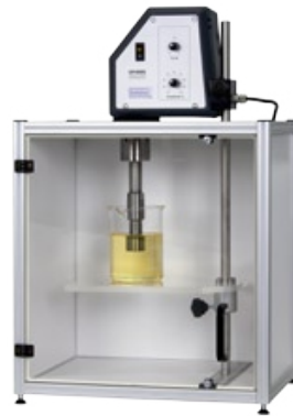
ultrasonic laboratory processors