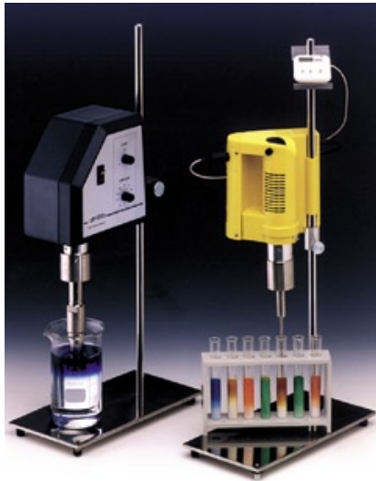
UP400S and UP200H with timer

As desk-space in the laboratory is expensive we supply ultrasonic processors in a compact design: Power supply, generator, control and transducer, all of which are located in an aesthetic housing. No additional cables impede.