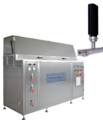
wire-, tape- and profile cleaning