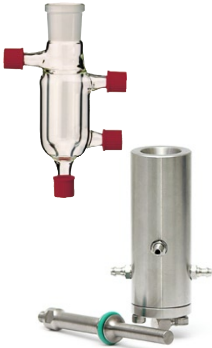
flow cells GD7K and D7K

The ultrasonic processor UP100H (100 watts, 30kHz) has the same dimensions as the UP50H but it is suited for the double power output. With the use of the 10mm sonotrode the field of applications expands to applications with volumes of up to 500ml.