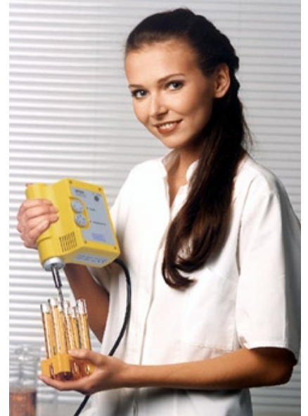
UP100H with MS3

For continuous operation only a flow cell and the appropriate 7mm sonotrode is required. Continuous processes in the smallest scale can be simulated. The optional PC-control may be helpful, if a test record is necessary or to optimize processes.