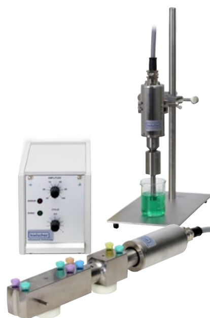
VialTweeter (front) and sonotrode (back) at ultrasonic processor UIS250v

The VialTweeter can be cleaned and disinfected easily. The VialTweeter is autoclavable and the transducer of the UIS250v is made of stainless steel (IP65, NEMA4). The generator is connected to the transducer by a 4m connection cable. Alternatively to the VialTweeter, the UIS250v can be equipped with sonotrodes for direct immersion into liquids. In that way, the UIS250v can be used as a hand-held or stand-mounted homogenizer.