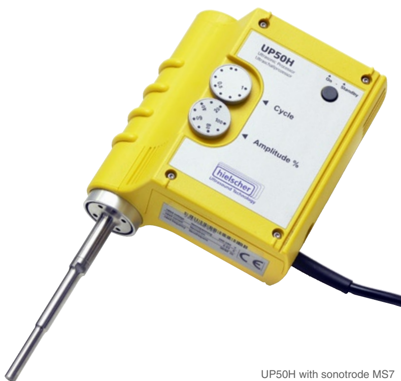
UP50H with sonotrode MS7

The ultrasonic processor UP50H (50 watts, 30kHz) is the smallest model of our aesthetic laboratory devices, that are only supplied by Hielscher Ultrasonics in that compact form.