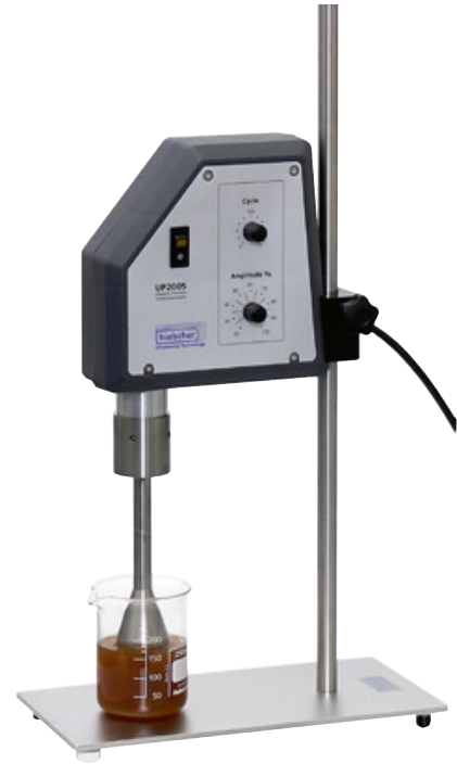
UP200S with S40

As all our laboratory devices the UP200S finds its customers worldwide. Without any additional fees we supply our devices for local power supplies from 100 to 240V and with the corresponding plugs.