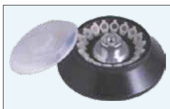
REA-1518 1.5/2.0ml x 18pcs Max.14,000rpm