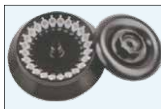
REAC-1524 1.5/2.0ml x 24pcs Max.14,000rpm