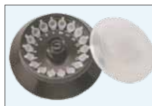
REAC-1518 1.5/2.0ml x 18pcs Max.14,000rpm