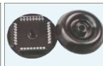
REAC-0232 0.2ml x 32pcs (8 Tube PCR strip x 4) Max.14,000rpm