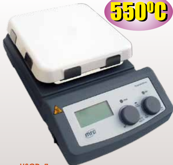
HSCD-7 Ceramic Hotplate Stirrer, 184x184mm

Automatically identify temperature sensor PT1000 and transfer to PT1000 operation mode. Record & display the last running parameters when switch on