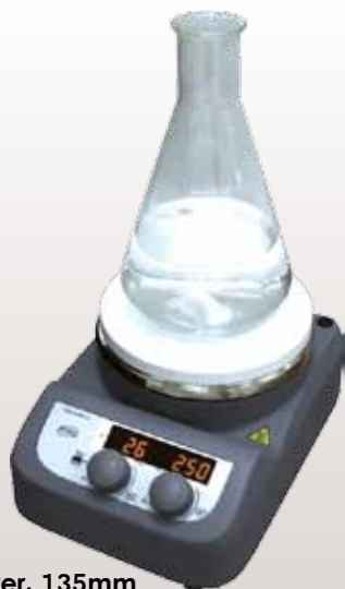
HSD-135 Digital Hotplate Stirrer, 135mm