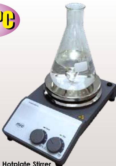
HS-135 Ø135mm, S.S Hotplate Stirrer