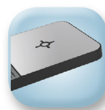
Stainless steel top for corrosion resistance