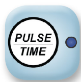
Pulse mode & Timer Function