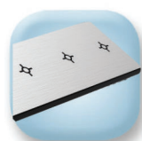
Slim Profile with Stainless Steel Top